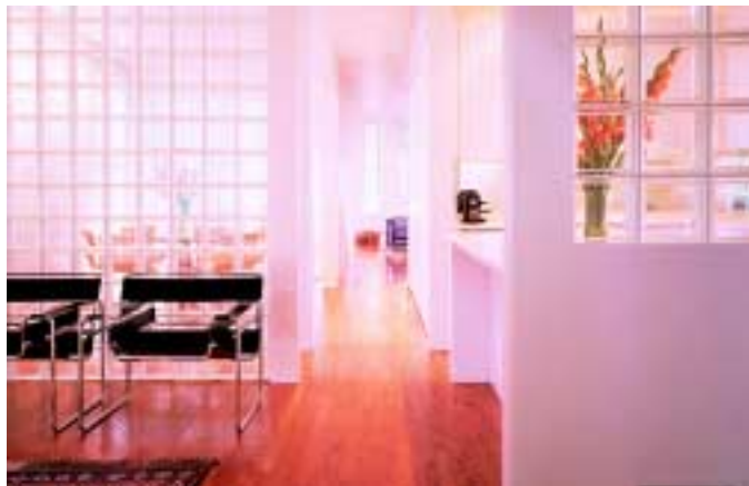
On the cover: An assemblage of 4" x 8" Premiere Series Glass Block in the DECORA® pattern bathes a bath in brilliant light and beauty.

With their variety of patterns, sizes and textures, Pittsburgh Corning Glass Block products adapt to your needs in any room.